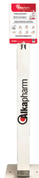
Mobile distributor Compatible with 500 mL and 1 L Alkafresh gel pump bottles. Foot pedal to avoid contact. Location for a poster intended for the public. Practical: gel level check window. Lockable. Reference ALKE233

FIND OUR ADDITIONAL PRODUCTS FOR THE CLEANING STEP ON OUR WEBSITE WWW.SODEL-SA.EU/EN