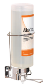
Stainless steel support for 1 L airless Reference AC0026