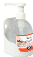
Plastic support for 300 and 500 mL pump bottles Reference AC0025